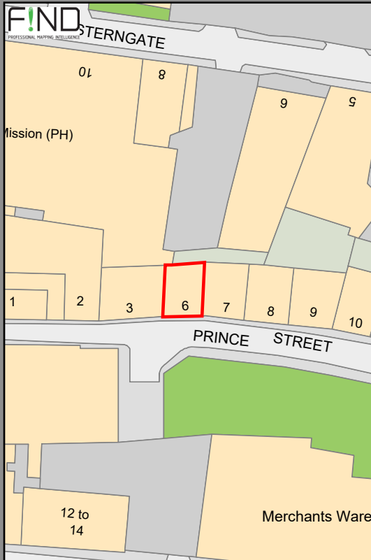
Not to Scale - For Identification Purposes Only

Scotts 01482 325634 www.scotts-property.co.uk